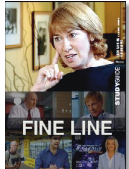
Fine Line study guide

Megan McMurchy , who produced Fine Line , a documentary series about the ethics of journalism, recently learnt just how important effective resources can be in ensuring that a program is used in education.